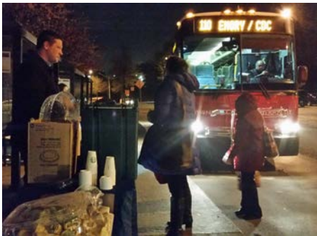
“Grand Opening” of Emory bus service for GCT