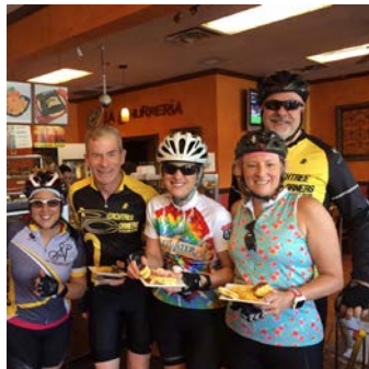
The Bite Ride