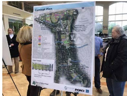
Indian Trail Open House hosted by Greater Atlanta Christian