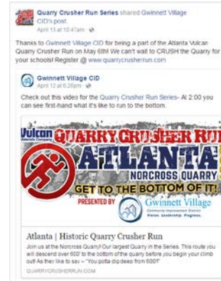
Quarry Crusher Run-benefitting GCPS